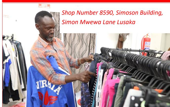
Shop Number 8590, Simoson Building, Simon Mwewa Lane Lusaka

Revenue from the sale of second hand clothes and shoes supports DAPP Zambia's over 100 development units. Thank you to our dear esteemed customers for supporting social development.