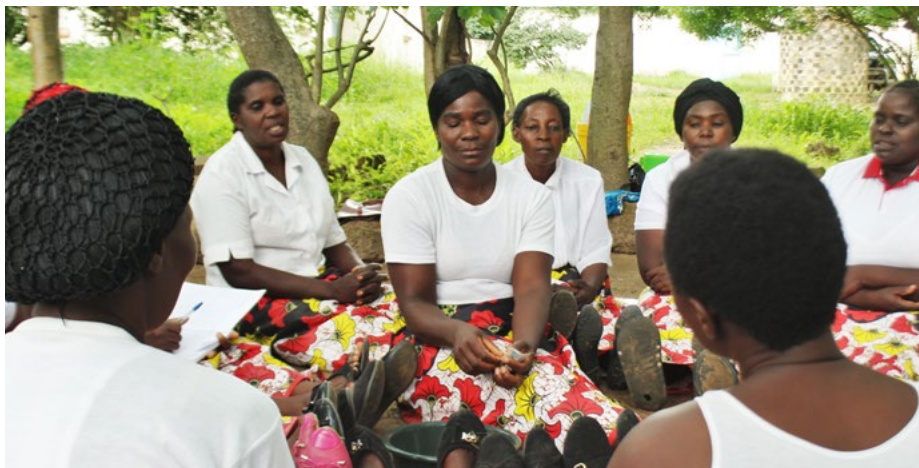
IN PICTURE: Members of a Self-Help Group in Monze counting their savings

They are also organising themselves to respond to challenges affecting their communities like GBV, early child marriages and household nutrition.