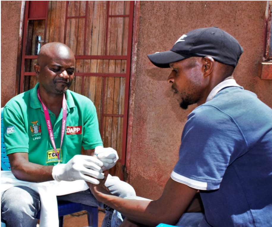
In Picture: TCE field officer conducting HIV test in Chipata Compound in Lusaka