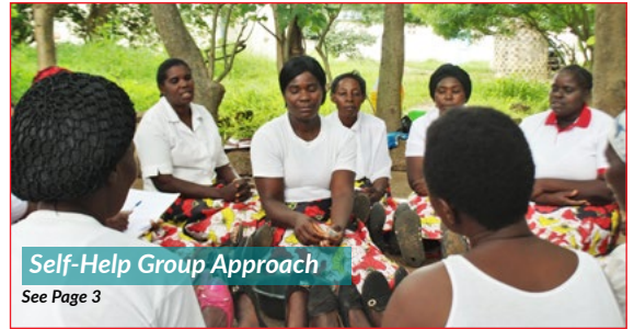
Self-Help Group Approach